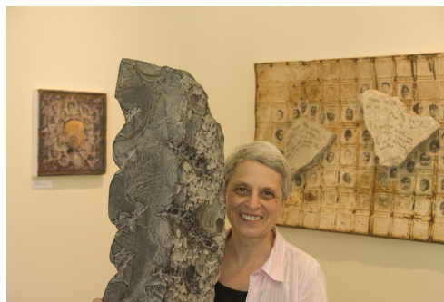
Amore said that: “Each piece is very individual in composition, color, and feeling.”