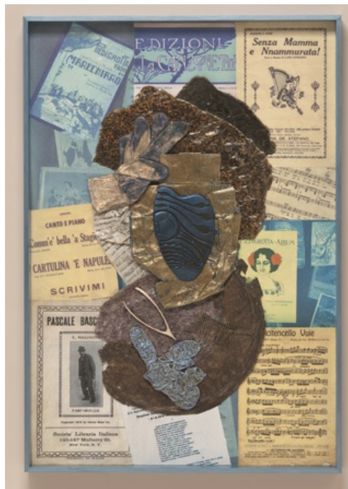
Art is everywhere—whether it is graffiti, painted murals, stunning yet decaying architecture, the fashion of the folk or the food itself.