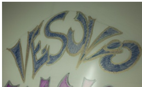
The influence of Naples on New York culture still resonates today.

Columbus Day Parade 2011 - Giulio Terzi di Sant'Agata