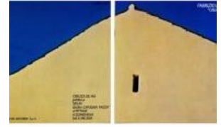
“Creûza de mă” sbarca negli Usa DANIELE DEVARCO